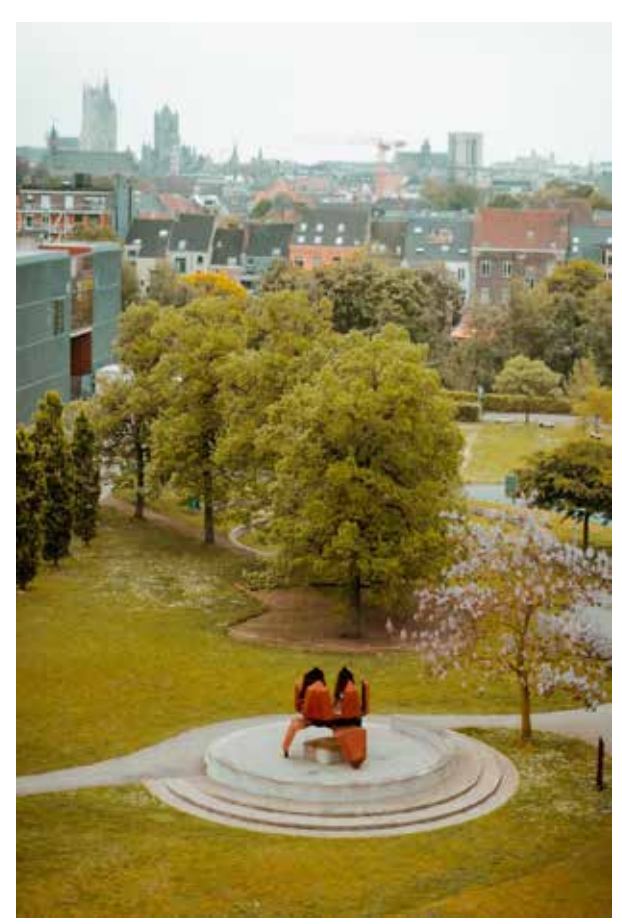
Technology Campus Gent

Find the full sports and culture offer and more information on the webpage: <a href="https://www.odisee.be/en/sport-and-culture">https://www.odisee.be/en/sport-and-culture</a>