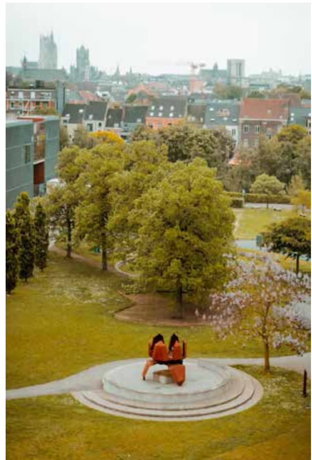
Technology Campus Gent

Find the full sports and culture offer and more information on the webpage: https://www.odisee.be/en/sport-and-culture